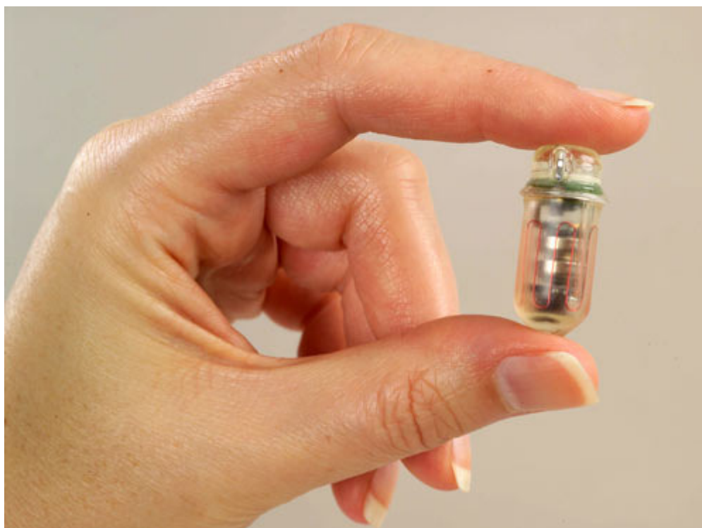
Figure. SmartPill. The SmartPill Wireless Motility Capsule is an ingestible device that uses sensors to measure pH, pressure, and temperature from within the gastrointestinal tract and sends information wirelessly to a remote server for health care professionals to assess. Reprinted with permission of the SmartPill Corporation. Photo by Donna Coveney.