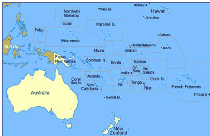
Figure 1. The US Associated Pacific Islands.

The USAPI annual per capita health care expenditure ranges from $140 in Chuuk to $1,032 in Guam; this stands in stark contrast to the annual US per capita expenditure of $5,711 (Table 1). Most islands depend on DDT funds to support their DPCPs. The average DDT funding award for the USAPI is $106,082, which covers administrative and staffing costs with modest support for community programs and outreach. Funding levels vary across jurisdictions depending on Congressional appropriations for the DDT competitive grant awards for DPCPs in the 50 states, territories, and island jurisdictions. Despite the persistent health care funding challenges amidst the growing epidemic of diabetes, the USAPI DPCPs have shown consistent capability and creativity in establishing partnerships across multiple sectors to leverage resources and broaden community outreach.