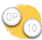
Oxycodone (e.g., Oxycontin, Percocet)