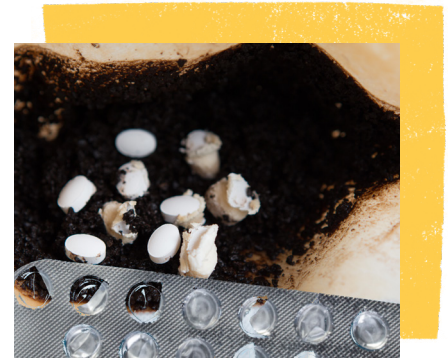
Disposing pills with coffee grounds