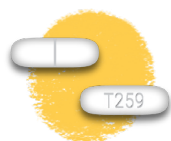
Hydrocodone (e.g., Vicodin)

Prescription opioids are a type of drug that can be prescribed to treat moderate to severe pain—but they can have serious risks and dangerous side effects. Common prescription opioids include hydrocodone (e.g., Vicodin), oxycodone (e.g., Oxycontin, Percocet), morphine (e.g., Kadian, Avinza), fentanyl patches (a synthetic opioid pain reliever), and codeine.