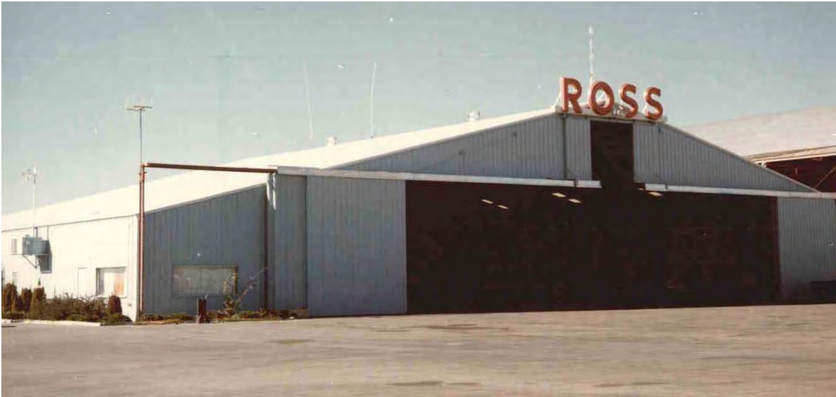
Figure 5-2: Hangar 481, Kirtland Air Force Base

According to the contract (Contract, 1989), the government-owned aircraft that were operated and maintained by Ross Aviation at Kirtland AFB consisted of the following: