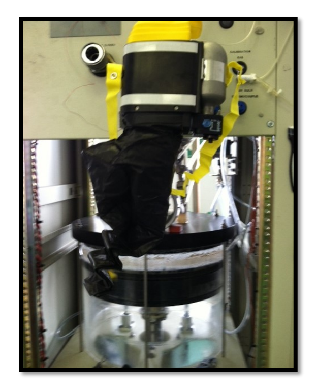
Figure 4. Front view of Ocenco M-20.2 breathing bag stuck in folded position

Three units tested on the ABMS during the third sample collection had breathing bags that were stuck in the folded position upon activation (See Figure 4). This caused the O<sub>2</sub> supply to deplete faster. Two of the three units that displayed stuck breathing bags failed to meet their rated service life of 10 minutes. Final results showed that 90 of the 97 units for which NIOSH evaluated and recorded data had normal results and would have provided a minimum of 10 minutes of lifesaving capacity. All 10 units tested using the Man Test 1 protocol yielded results within monitored stressor parameters and would provide a minimum of 10 minutes lifesaving capacity.