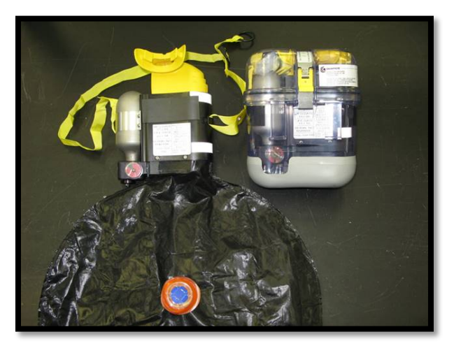
Figure 1. Ocenco M-20.2 EEBD

Storage conditions for the M-20.2 should not exceed a minimum temperature of 4°F (-20°C) or exceed a maximum temperature of 149°F (65°C). The M-20.2 has a service life of 15 years from the date of manufacture when the proper conditions of use are followed. If the M-20.2 is belt-worn, it must be returned for factory service after five years. When shelf-stored, the M-20.2 can remain in service for 15 years without factory service.