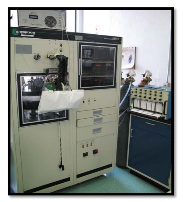
Figure 3. Automated Breathing and Metabolic Simulator

NIOSH personnel tested the EEBDs on the ABMS using a constant average metabolic work rate (Table 2). All ABMS tests were conducted to endpoints under constant operating conditions. During testing, the ABMS continuously monitored metabolic stressors which included inhaled levels of CO_2 and O_2 , wetand dry-bulb temperatures, and inhalation and exhalation breathing resistances (pressures) until the test was terminated. Tests on the ABMS are terminated upon one of three endpoints: (1) exhaustion of the O_2 supply as indicated by inhalation pressures reaching -200 mm H<sub>2</sub>O, coinciding with an empty breathing bag; (2) average inhaled CO_2 levels exceeding 10%; or (3) O_2 levels falling below 15%. When these limits are exceeded, the ABMS gas metabolism is compromised and further data are not acceptable for analysis. Peak breathing pressures of -300 and +200 mm H<sub>2</sub>O have been identified as the outer limits of what is humanly tolerable based on research conducted at Penn State's Noll Laboratory (Hodgson, J). Breathing resistances measured for all EEBDs tested were within these limits.