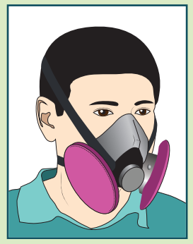
EHMR with an exhalation valve