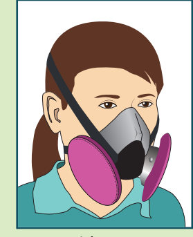
EHMR with no exhalation valve