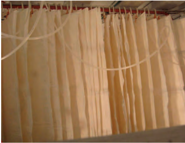
Passive lithium curtains for scrubbing carbon dioxide.

ture. Finally, one manufacturer, without NIOSH participation, completed a short-term human subject evaluation. The results of the human occupation test were sent to and reviewed by NIOSH for verification that the scrubber containers were redesigned to prevent spillage and that the apparent temperature met the West Virginia standard.