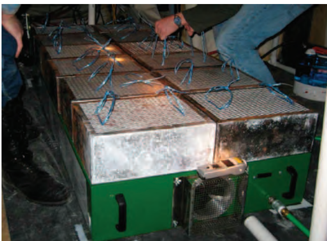
Air powered soda lime carbon dioxide scrubber system.

MSHA data from August 2007 on mechanized mining units (MMU's) places the number of MMU's at 873 and the total underground mines at approximately 464. According to the individual states, the number of operating underground coal mines exceeds 800 as seen in Table 3. Despite this variation, if all underground coal mines in the U.S. were required to have a refuge chamber on each working face, it is estimated that from 450 to more than 1,000 chambers might be required.