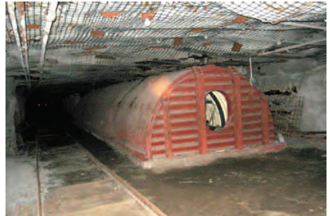
Refuge chamber located in Bruceton Safety Research Mine.

escaping miners found it and they successfully activated the breathable air systems. A second group most likely to benefit were the miners who barricaded. While barricades were used in only two relevant incidents, these