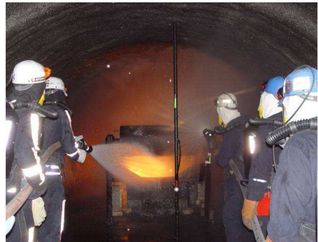
Figure 3 — NIOSH LLL outdoor fire gallery (simulated belt entry) showing two teams extinguishing a fire.

The SRCM is a conventional room-and-pillar operation approximately the size of a large working section of a coal mine and is utilized for mine health and safety research in areas such as ground control, ventilation, fires, emergency response, materials handling, communications, remote sensing and drilling and environmental monitoring. This research mine also has a reversible fan, water hydrants, electric power and compressed air. Although it is not publicly available for regular use, the real-life environment makes it an attractive place to conduct mine rescue and fire brigade training research, including a variety of smoke-training exercises and mine emergency response development (MERD) drills. The MERD incident command center, shown in Fig. 4, is located next to the mine and includes communications and mine rescue team staging areas.