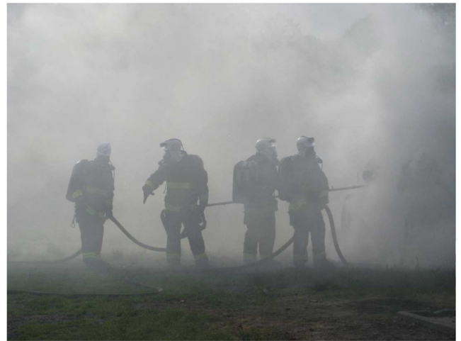
Figure 6 — Mine rescue team fighting a fire at the MSHA MSL fire gallery.

8. RLC Coal Mining Training Center, Rend Lake Community College, Ina, IL ( http://www.rlc.edu/ ). Rend Lake Community College, in partnership with the state of Illinois and the federal government, has been awarded funding to design, engineer, equip and construct a coal-mining training facility to revitalize its mining technology program. This program will