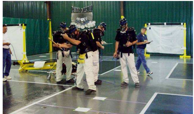
Figure 2 — The indoor mine rescue contest practice field at Consol Energy's Buchanan Mine training facility.

3. NIOSH Bruceton Coal Mine, Pittsburgh Research Lab; Bruceton, PA ( http://www.cdc.gov/niosh/mining/ ). There are actually two adjacent mines at this location, the Safety Research Coal Mine (SRCM) and Experimental Mine, which are used to support health and safety research for mine workers. The Experimental Coal Mine, currently not available to the public, consists of two drift entries and multiple rooms with concrete floors driven into the Pittsburgh coal seam. It was created to support full-scale mine ventilation, fire and explosion tests. There are two areas specially designed to handle large fires without risk of the coal seam catching on fire.