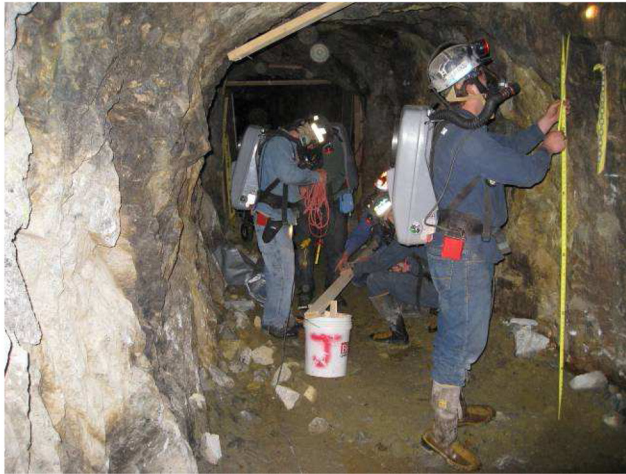
Figure 8 — Edgar Mine MERD exercise showing teams building a ventilation control.

Sumiton Campus, was established to meet the immediate needs of Alabama coal companies for mine workers and to create a pipeline of future skilled workers. It offers short-term academic certificate programs and other training, including a new underground miner, refresher, mine electrician, first aid/CPR and mine rescue. This facility is available for public use.