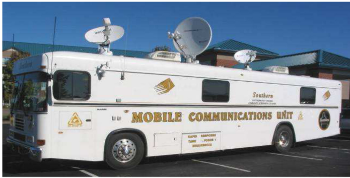
Figure 7 — SWVCTC Mobile Communications Unit (Command 1) equipped with a multiple-satellite communication system.