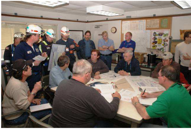
Figure 4 — MERD incident command center exercise at the NIOSH Bruceton Coal Mine.

themselves and to take action. WVU believes that every miner, fire brigadesman and mine rescue team member should have, at a minimum, first responder training.