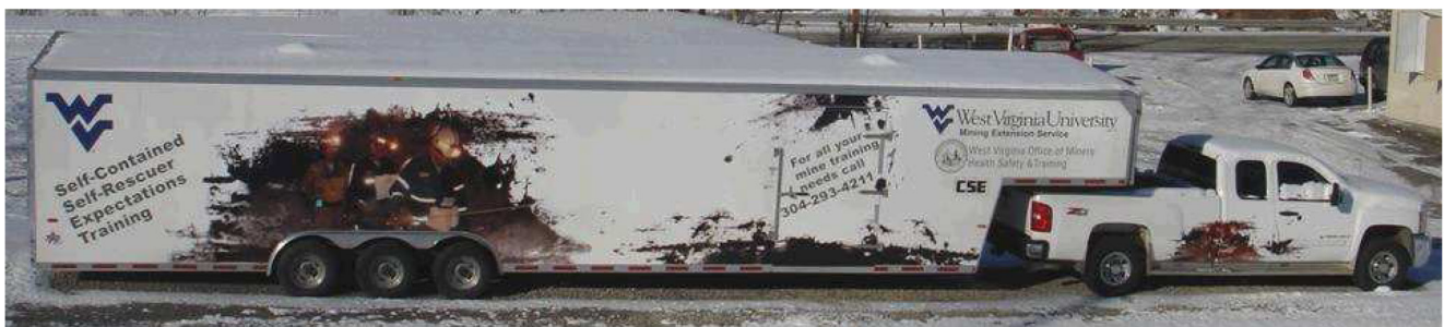
Figure 5 — WVU Mining E&O’s mobile unit (The Truck) for first responder training in a smoke maze.

The lower floor of the building, shown in Fig. 6, simulates a typical room-and-pillar coal mine, with four entries and nine crosscuts (Dept of Labor, MSHA, Mine Simulation Lab 2008). The burn area, on one end of the building, includes an incombustible burn tunnel and concrete pads. Mine rescue training includes problem solving and first aid classroom courses, numerous outdoor firefighting drills, exploration and navigation in poor visibility and other exercises where team members conduct hands-on mine rescue tasks, including the construction of temporary and permanent ventilation controls while under apparatus. Other noteworthy features of this complex are dormitory space for 320 people, classrooms and laboratories that can accommodate 600 students, a cafeteria,