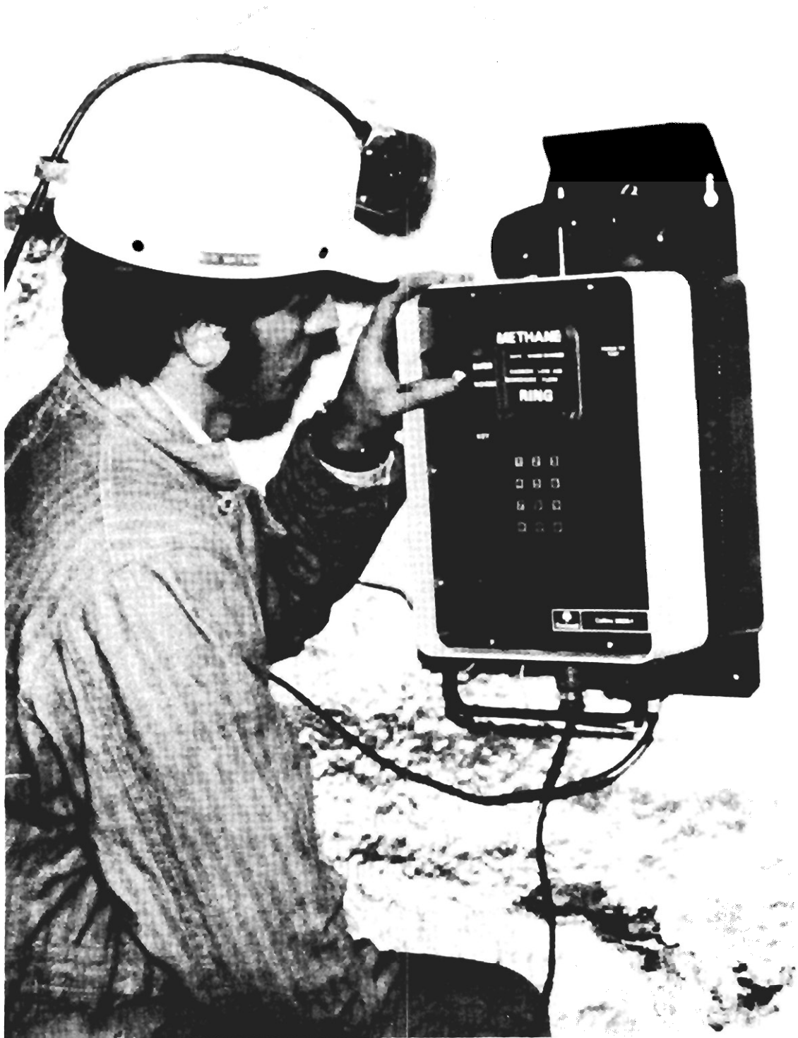
Figure 2--An Underground Telephone Being Activated to Signal Through-the-Earth.