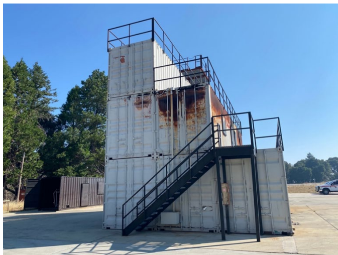
Figure B2. BRAVO SIDE.