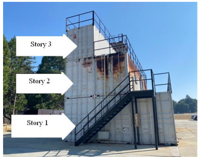
Figure 1. The training tower involved in the incident.

The Recruit had completed the first four exercises, and he was working his way through the maze when he became unresponsive. The maze was designed to allow an instructor to stay in verbal communication and observe the recruits as they navigated through the obstacles. The Recruit was approximately six feet from completing the maze when he had difficulty finding the exit, which was an