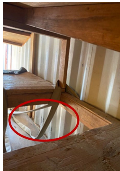
Figure 8. Middle level to bottom level that leads to exit with location of Recruit's collapse indicated by red oval.