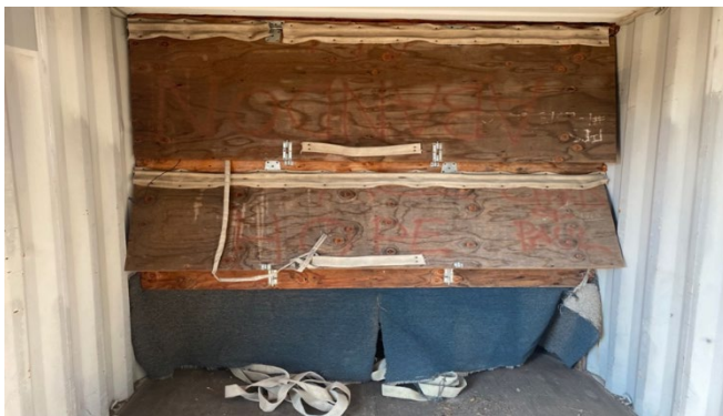
Figure 3. Maze with closed emergency access doors to middle and top levels and skirting lowered at bottom level.