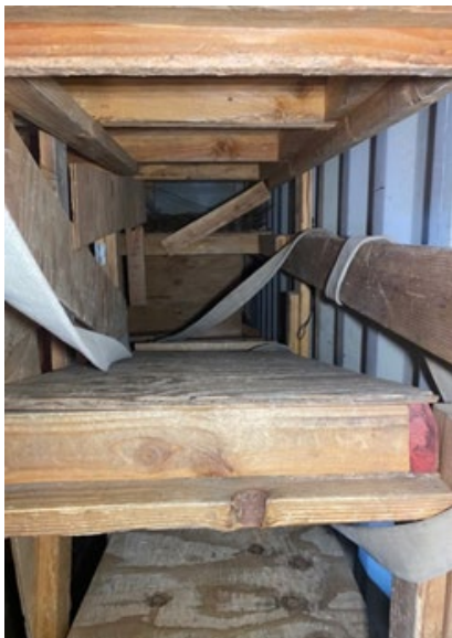
Figure 7. Decline to top of bottom level.