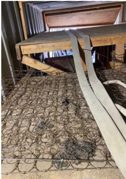
Figure 5. View from top to middle level.

There were no significant obstructions in this first section as the recruits entered and a hoseline was used as a guide for the recruits to follow the correct path as they went through the maze. Recruits encountered different obstacles such as diminished clearance, mattress springs, debris, inclines, and declines (Figures 5–8).