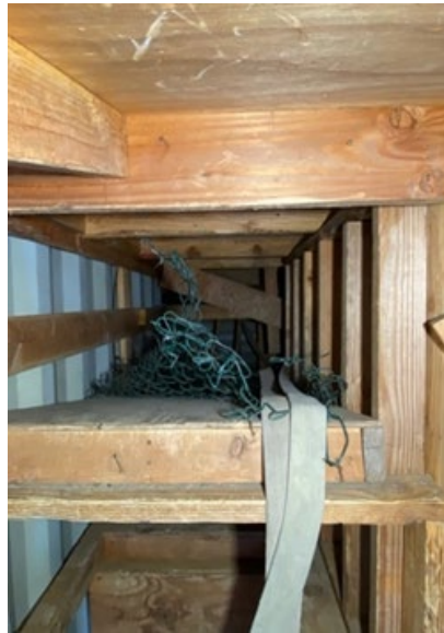
Figure 6. Diminished clearance.