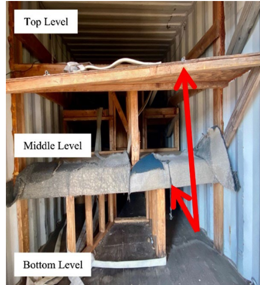
Figure 2. SCBA maze with three levels. Arrows pointing to middle level open emergency door and raised drape to bottom level.

There were two emergency exits in the form of hinged wooden doors, located at the front of the prop at the top and middle levels with skirting at the bottom level to reduce incoming light into the maze (Figures 3 and 4). Emergency exit access was less than 20 feet from any area within the maze. This was within the recommended 50 feet maximum identified by NFPA 1402 Standards on Training for Fire Facilities and Props, Section 11.3.1 Technical Rescue Training Props .