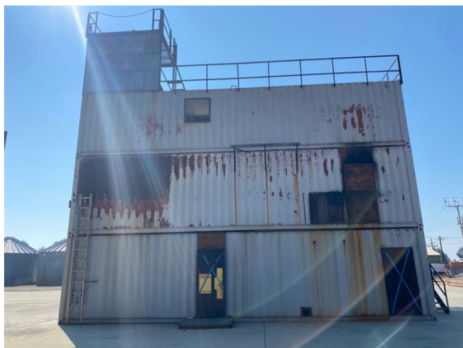
Figure B3. CHARLIE SIDE.