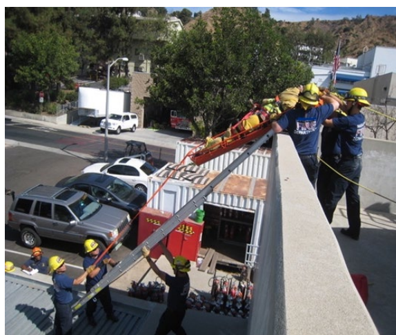
Figure 9. Ladder slide demonstration showing how the Recruit was lowered to the second story of the tower. Not from actual tower.

Initially, the AED did not indicate a shockable rhythm. The ALS ground ambulance was on scene when the Recruit was lowered to the ground. The AED unit noted that CPR was interrupted less than ten seconds as he was lowered to the second story. An air transport nurse and ALS medic arrived and