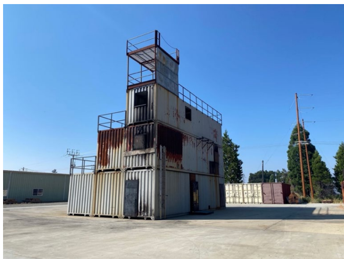
Figure B4. CHARLIE/DELTA VIEW.