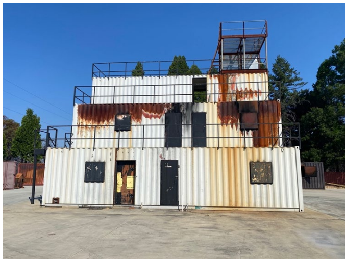
Figure B1. ALPHA SIDE.