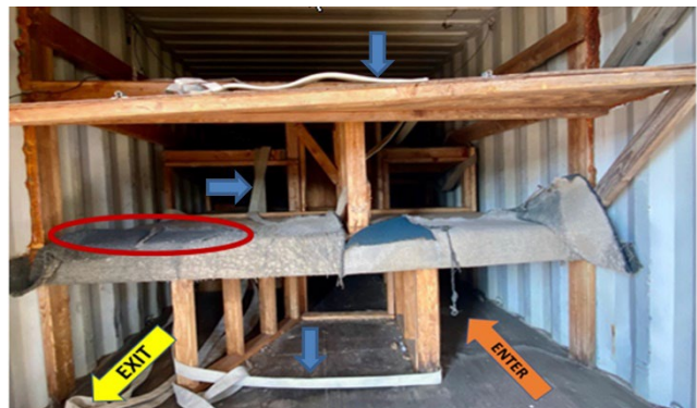
Figure 4. Cross section of the maze showing direction of movement and red oval indicates location where the Recruit collapsed. Blue arrows indicate hose line recruits used as a guide.

There were two instructors inside the maze building; a primary instructor and an assistant instructor. There was no safety officer. The primary instructor was inside the maze and provided direct supervision of recruits. Students entered the maze on the right side of the bottom level and would proceed to the rear corner while the primary instructor maintained visual and verbal contact with them. The assistant instructor was located outside of the maze itself and assisted with the coordination of recruits entering the maze and with emergency situations, if needed.