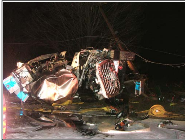
Photo of the crashed tanker at the incident scene.