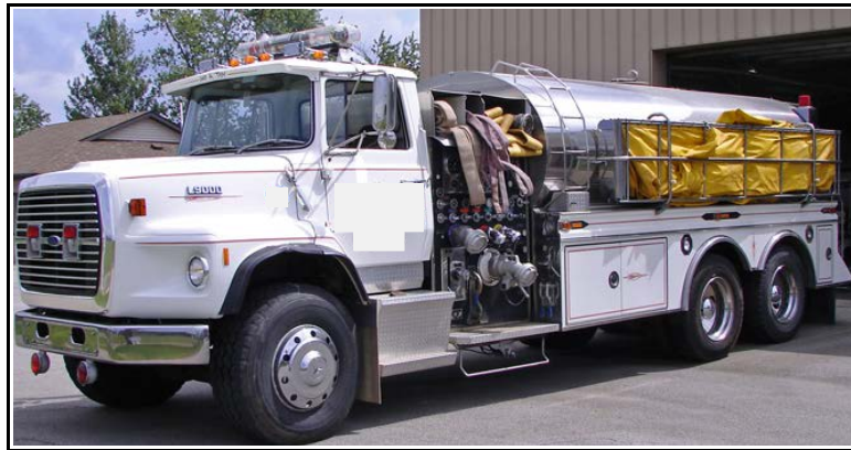
Photo 1. Photo of a tanker that is similar to the one involved in the crash.

The apparatus involved in this incident, Tanker 64 (T64), was a 1979 diesel, three-axle tanker/pumper (see Photo 1). Maintenance records reveal that mileage was recorded at 26,171 in August of 2012. The ten tires were in good condition and the front and rear drum brakes were inspected regularly with no reported operational issues. An elliptical 3,500 gallon capacity stainless steel water tank, equipped with transverse and longitudinal baffles, had been installed on the chassis in 1998 by an authorized tanker apparatus company. The tank was reported to be filled to capacity when it left the station on the evening of the incident and would have been within the 54,000-pound gross vehicle weight rating (GVWR) requirement of the truck.