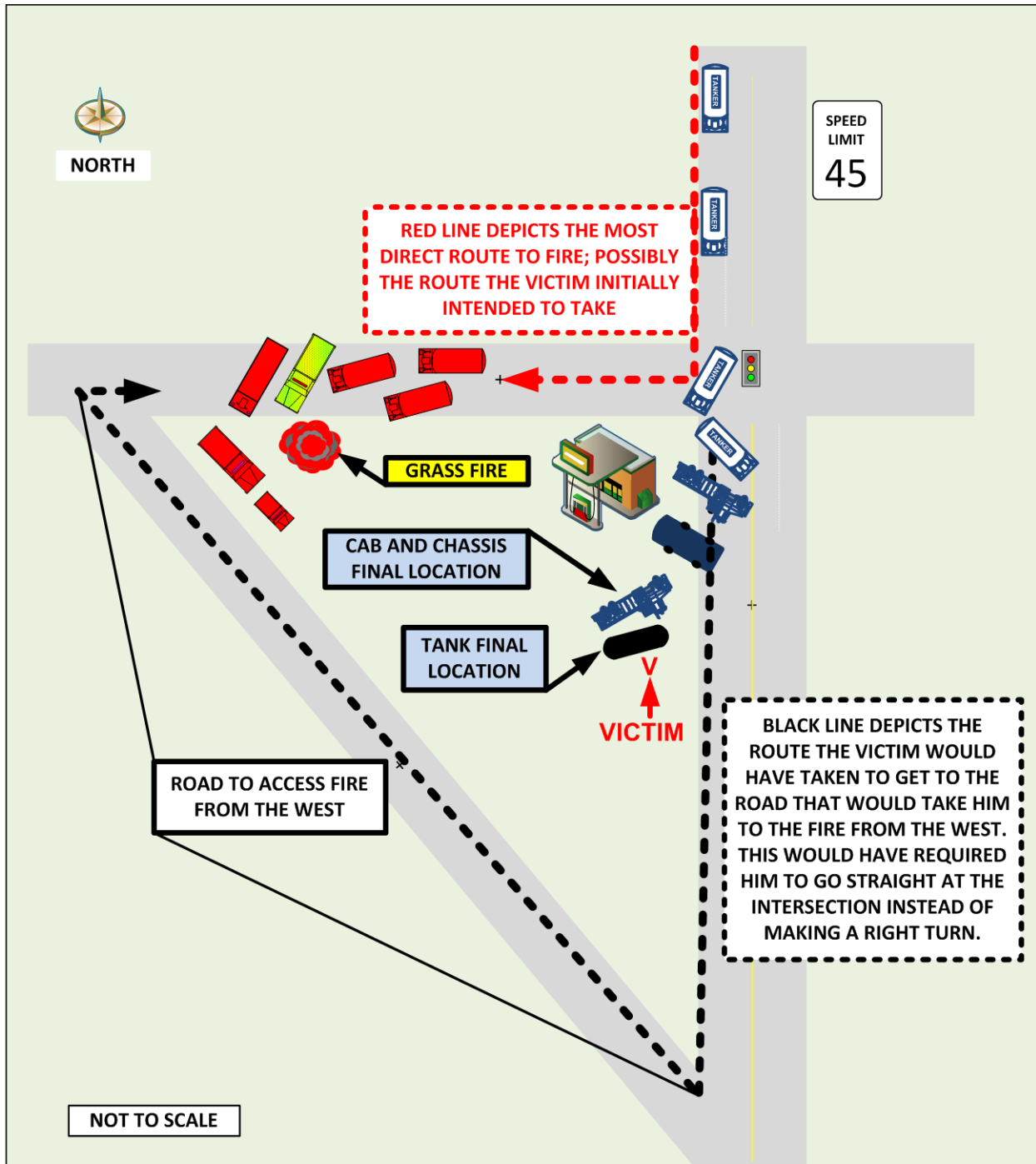
Diagram. Depicts tanker path-of-travel, fire location, and crash scene.