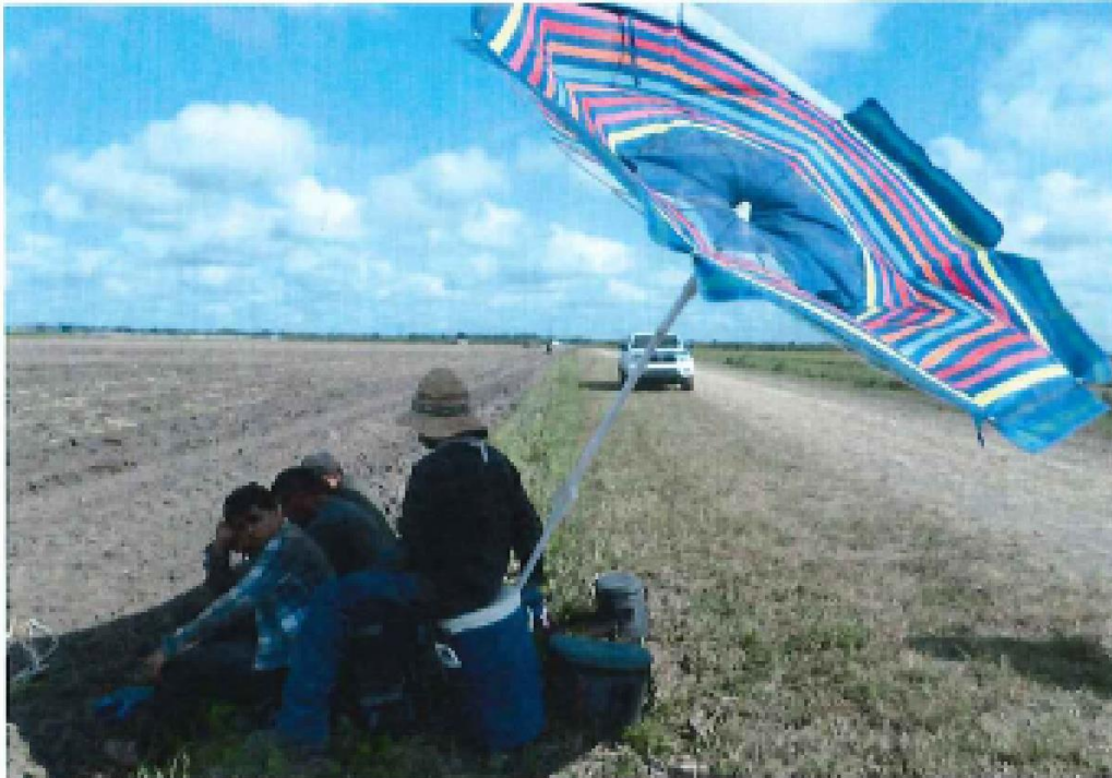
Exhibit 3. Sugarcane field with worker rest area