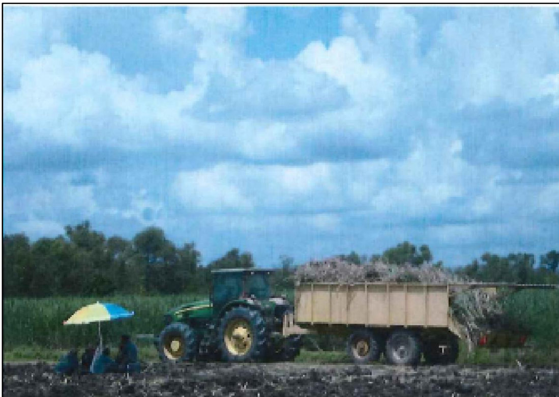
Exhibit 1. Tractor pulling trailer of seed cane for planting with several workers huddled for shade under single umbrella

Monday, August 5, 2019, was the first day the decedent worked as a sugarcane planter. At this farm sugarcane planting crews work in groups of four including a tractor driver and three planters. One worker drives the tractor pulling a trailer full of seed cane. The other three workers walk behind the trailer, pull stalks of sugarcane off the trailer, and lay the sugarcane by hand in rows that have been previously plowed.