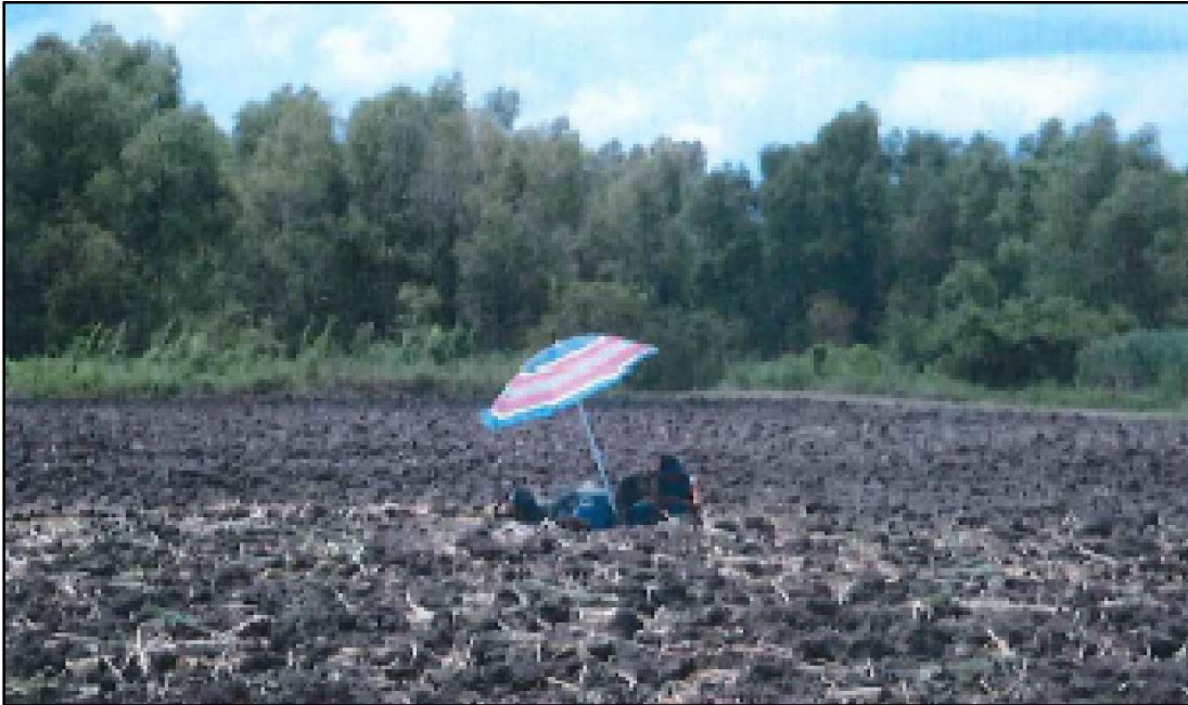
Exhibit 2. Sugarcane field with worker rest area

After they finished the second trailer of sugarcane, they took another break where they rested under an umbrella. During the break, one of his co-workers noticed that the decedent was having difficulty breathing. He was breathing fast, not speaking at all, and he was very sweaty. After the break, the crew resumed planting and had been working for just a few minutes when they noticed that the decedent was balancing himself on the trailer with labored breathing again. They stopped the tractor and told him to get some water, and as he was going to get water, he began to lose his balance. They guided him to a seated position to keep him from falling. Shortly after he sat down, he appeared to be hallucinating, after which he lost consciousness.