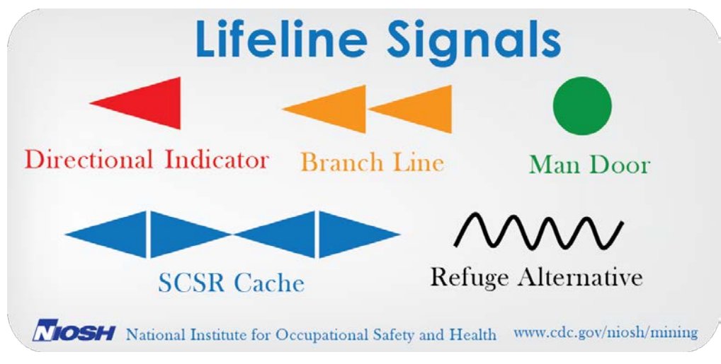
Figure E1. Lifeline Signals sticker.

Despite the implementation of the new lifeline safety feature, mine workers may not always remember what the signals mean, especially in an emergency situation. It is important that mine workers are able to identify the signals reliably because it could save them a significant amount of time while trying to escape.