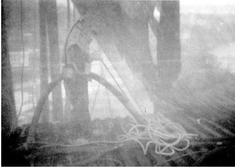
Figure 1. Construction worker using a HEPA-filter vacuum inside a containment structure. Note that the worker is obscured by a high airborne concentration of dust.