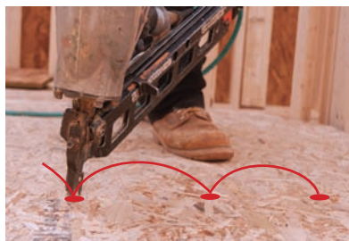
Bump firing or bounce nailing is using a nail gun with a contact trigger held squeezed and bumping or bouncing the tool along the work piece to fire nails. Red dots show path of motion.