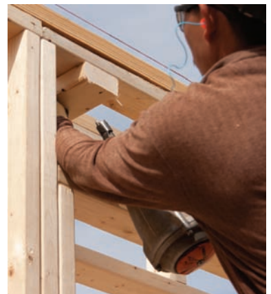
Nail penetration through the lumber is a special concern where the piece is held in place by hand