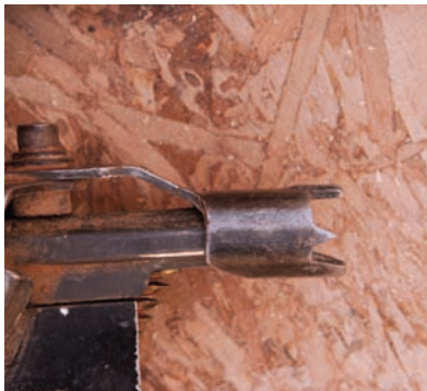
Contact safety tip