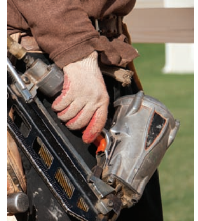
Common nail gun grip with finger on trigger

Bypassing or disabling certain features of either the trigger or safety contact tip is an important risk of injury. For example, removing the spring from the safety contact tip makes an unintended discharge even more likely. Modifying tools can lead to safety problems for anyone who uses the nail gun. Nail gun manufacturers strongly recommend against bypassing safety features, and voluntary standards prohibit modifications or tampering. 7 OSHA's Construction standard at 29 CFR 1926.300(a) requires that all hand and power tools and similar equipment, whether furnished by the employer or the employee shall be maintained in a safe condition.