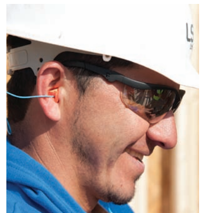
Worker using recommended PPE when working with nail guns: hard hat, safety glasses, and hearing protection