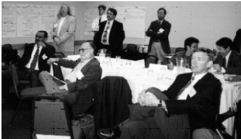
March 1998 Chicago NORA Focus Group Meeting

In addition, new ideas contributed by the academicians and researchers at the Houston workgroup meeting were added to the listings. The resulting four lists of research issues are provided in Appendix A. These lists are designed to provide comprehensive inventories of the issues only and do not provide any indications about what the NORA MSD team believes about the priority or importance of individual research issues. Some of the issues identified in the focus groups applied to more than one industry, while others were primarily applicable to specific industries. The selected industry-specific topics are listed in Appendix B. The Houston workgroup was asked to identify research topics where progress seemed most likely in the next five years. Those ideas are listed in Appendix C.