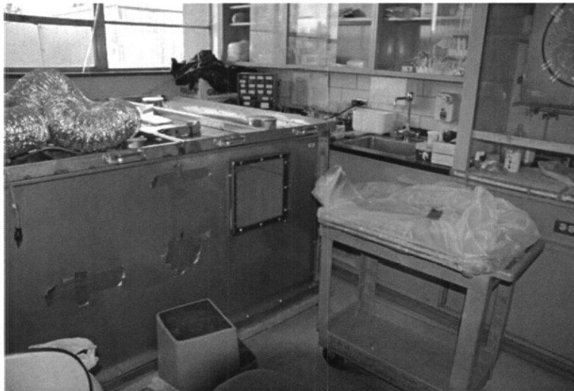
Figure 3. Drywall being removed for transportation to an area to be sampled.

After the material was removed from the chamber, it was placed in a plastic bag and transported to an area to be sampled using three different solvents (methanol, isopropanol, and distilled water).