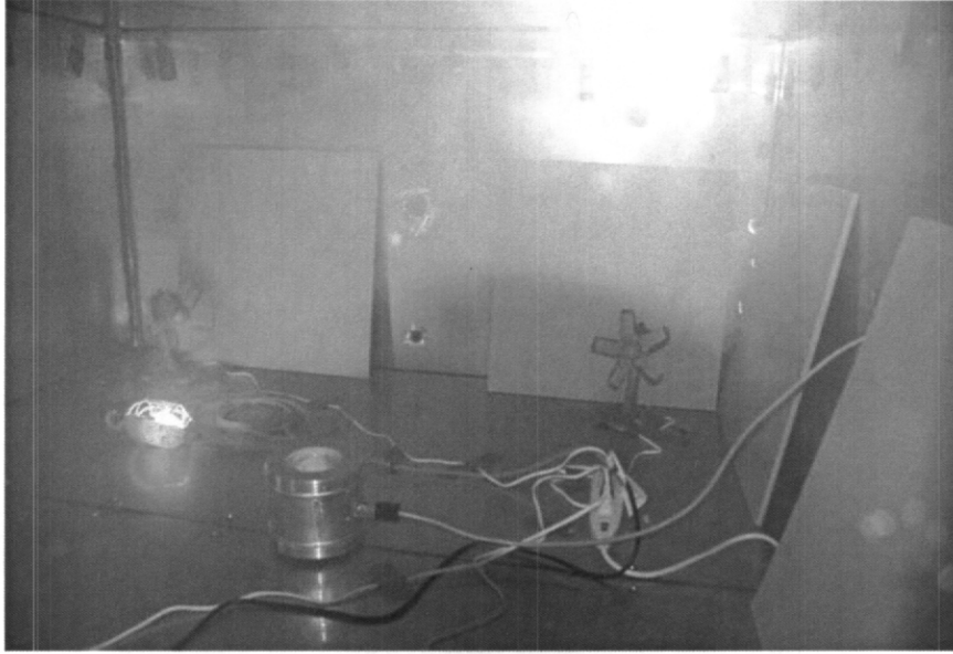
Figure 2. Painted drywall material being contaminated within the chamber.

After the material was removed from the chamber, it was placed in a plastic bag and transported to an area to be sampled using three different solvents (methanol, isopropanol, and distilled water).