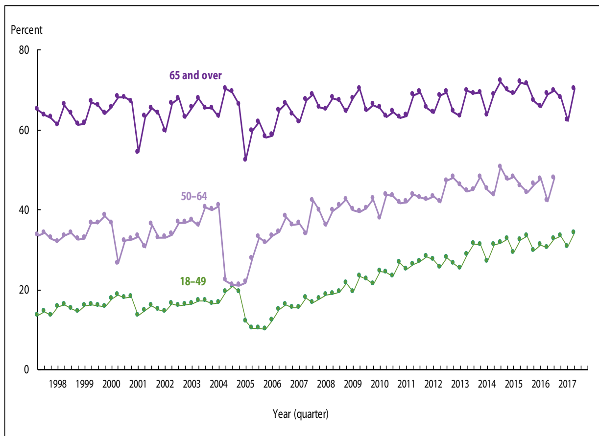
Figure 4.1. Percentage of adults aged 18 and over who received an influenza vaccination during the past 12 months, by age group and quarter: United States, 1997–March 2017

NOTES: Data are based on household interviews of a sample of the civilian noninstitutionalized population. Respondents were asked if they received a flu vaccination during the past 12 months. Starting in August 2010, questions were modified to reflect that the seasonal influenza vaccine included protection for the 2009 pandemic H1N1 virus. Prevalence of influenza vaccination during the past 12 months is different from season-specific coverage (see https://www.cdc.gov/flu/fluview/ ). Advisory Committee on Immunization Practices recommendations regarding who should receive an influenza vaccination have changed over the years, and changes in coverage estimates may reflect changes in recommendations (4–8). The analyses exclude the 2.0% of persons with unknown influenza vaccination status. See Technical Notes for more details.