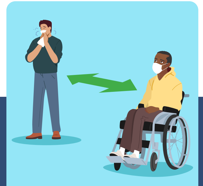
Keep a safe distance

Find inclusive health messaging and materials at https://bit.ly/Disability-Materials