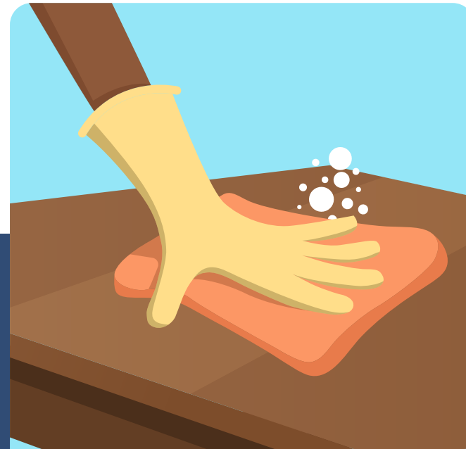
Keep it clean