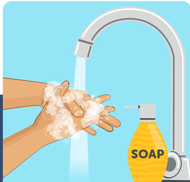
Wash your hands