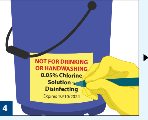
Label bucket "0.05% Chlorine Solution - Disinfecting " and add an expiration date.

Add TWO tablespoons (30g) of chlorine powder (35%) to 20 liters of water in a bucket. *also referred to as bleaching powder or chlorinated lime