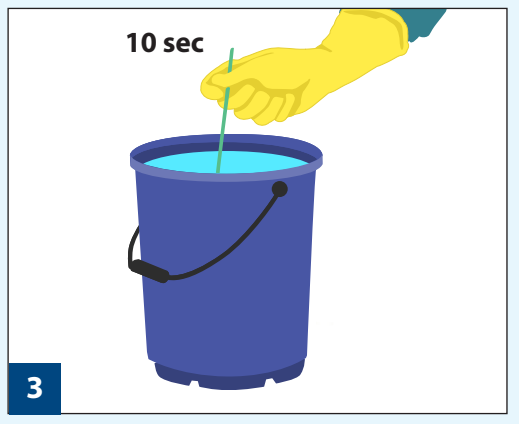
Stir well for 10 seconds, or until chlorine powder/granules have dissolved.

Make sure to wear gloves, a mask, and clothing that covers the skin. Note: An apron and eye protection may be used, if available, to protect against splash risk.