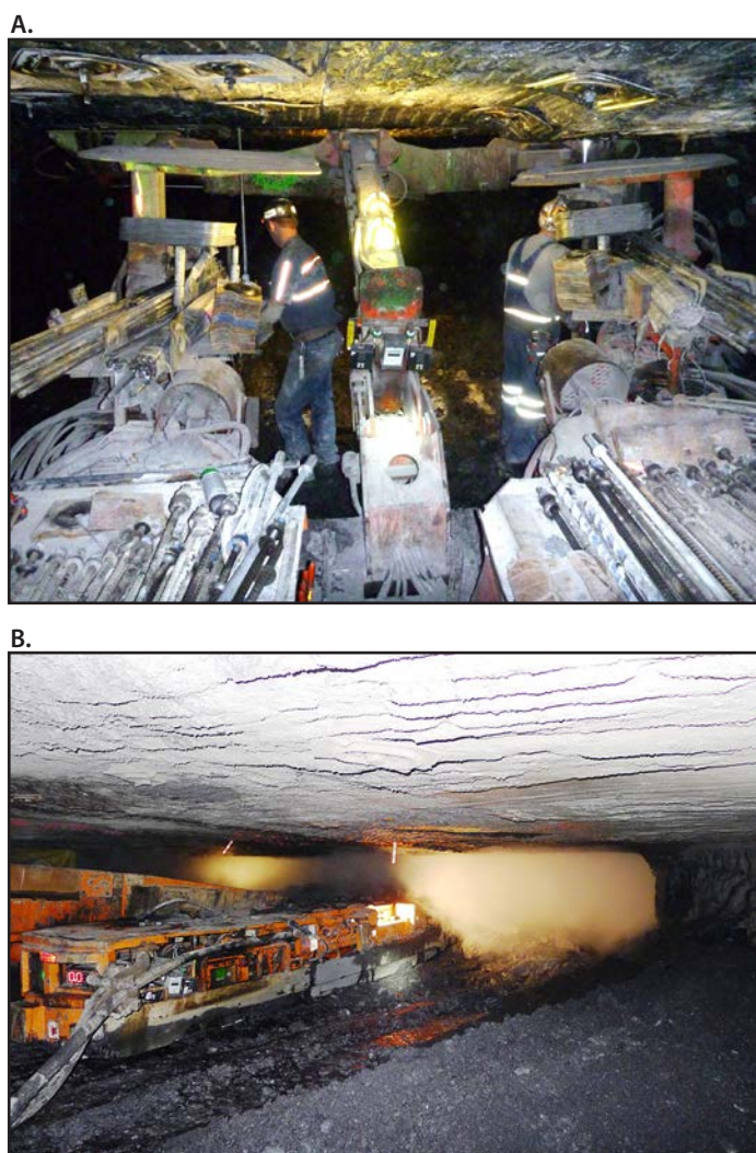
FIGURE 2. Photographs of workers and equipment under typical conditions in an underground coal mine*

* A. Two miners use a roof-bolting machine to install the bolts that support the roof of an underground coal mine. B. A continuous miner machine extracts coal from the mine face with a rotating drum.