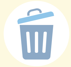
Dispose of Gown & Gloves in Room

Use EBP during high-contact care activities for residents with: