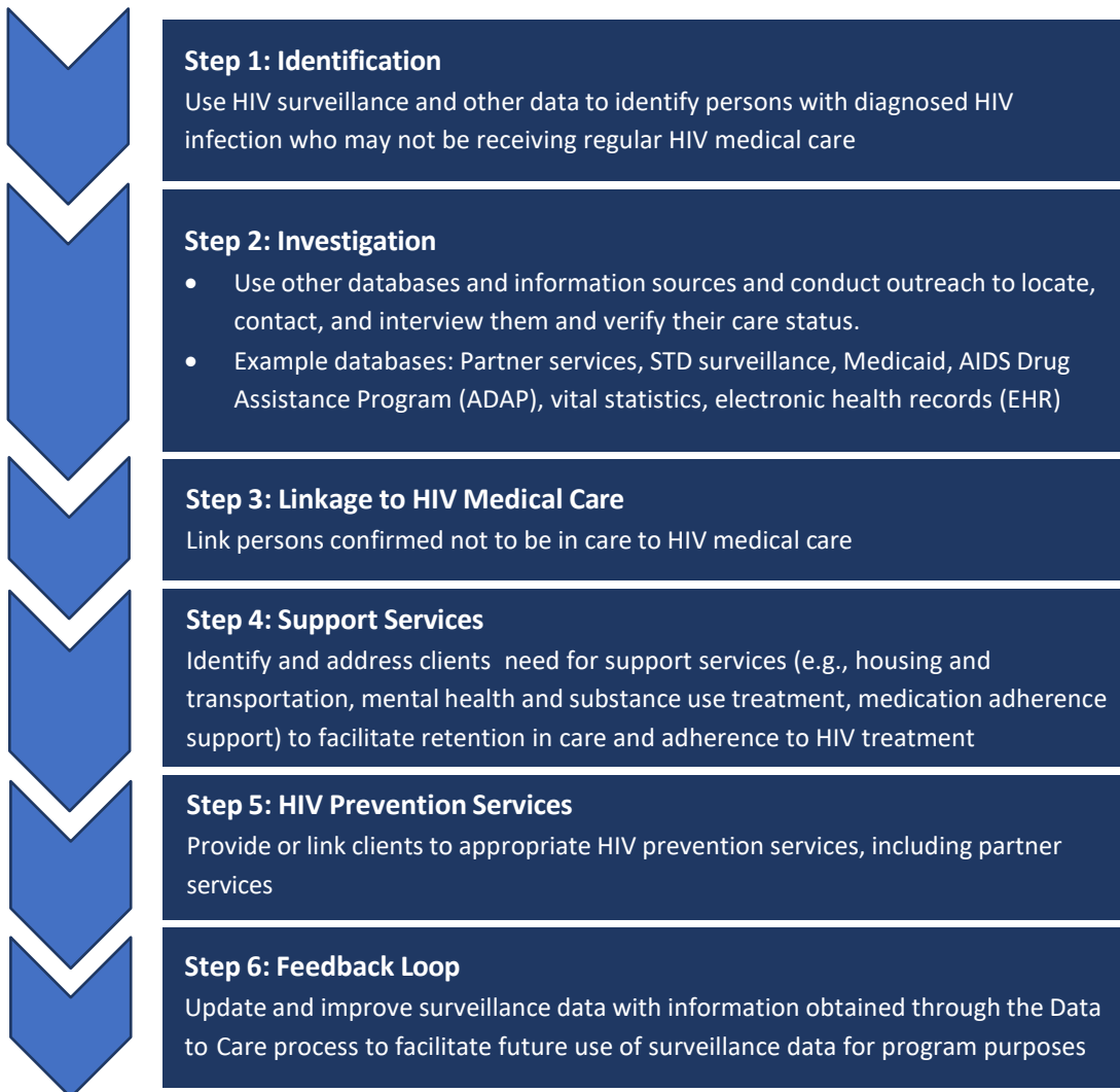
Figure 1. Main Steps in Data-to-Care Not-in-Care Programs

The graphic below depicts the six main operational steps involved in a D2C NIC program: