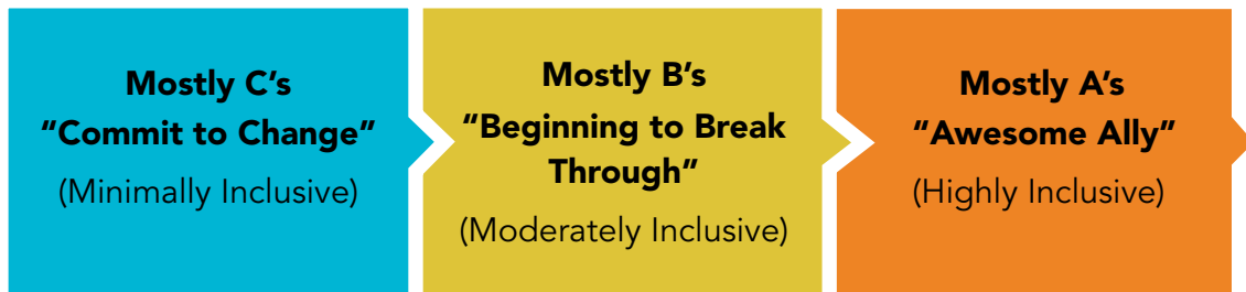
Figure 3. Tips and Resources for Educators a