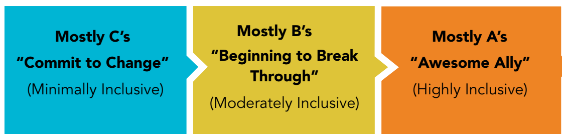
Figure 2. Tips and Resources for All Users a