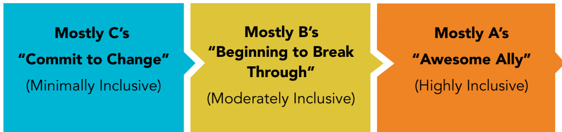
Figure 5. Tips and Resources for School Health Service Staff a