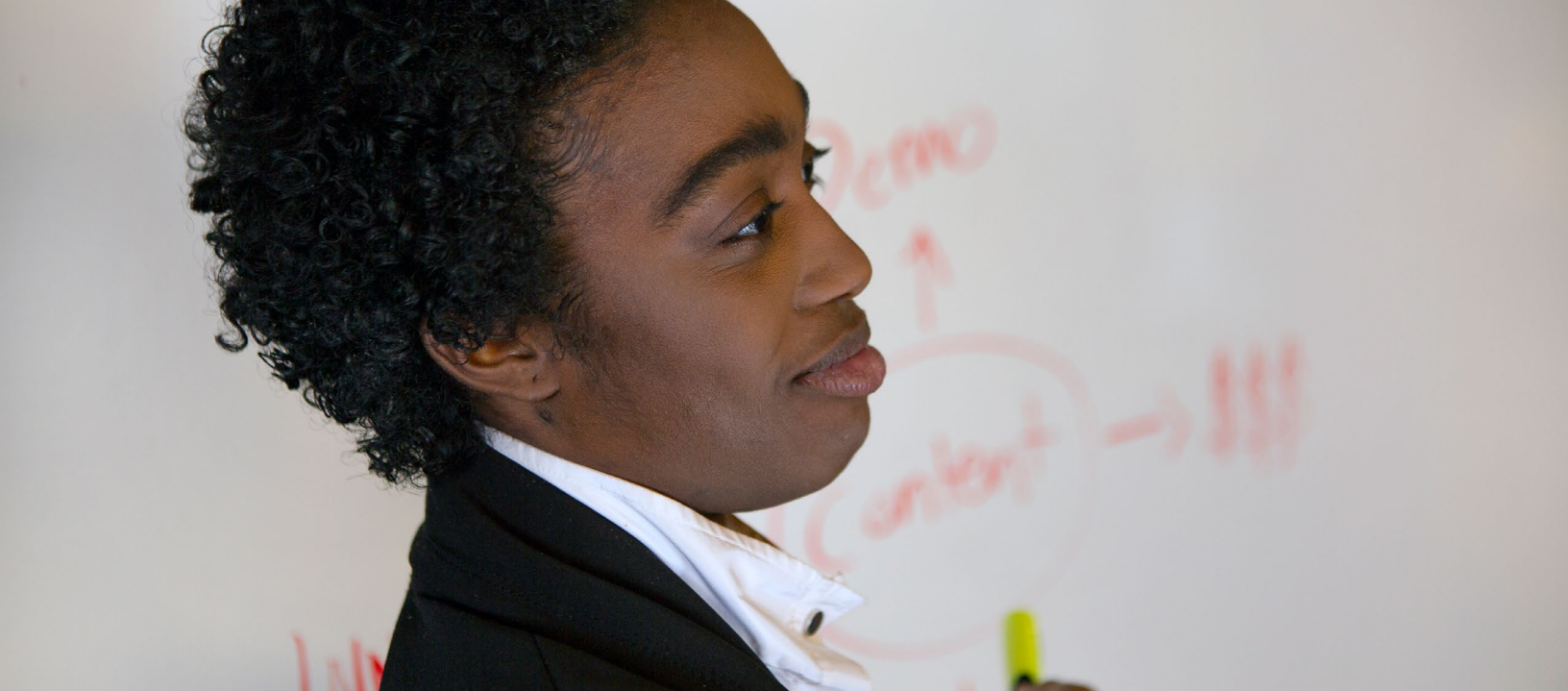
This Photo is a part of The Gender Spectrum Collection by Zackary Drucker