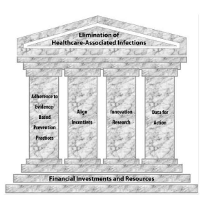
Figure 1. Framework for the elimination of healthcare-associated infections.

Elimination of HAI requires a public health model of constant action and vigilance to promote adherence to evidence-based practices; alignment of incentives and reinvestment in successful strategies; filling knowledge gaps to respond to known and emerging threats through research; and collecting data to target prevention efforts and to measure progress. These efforts must be underpinned by sufficient financial investments and resources (Figure 1).<sup>2</sup>