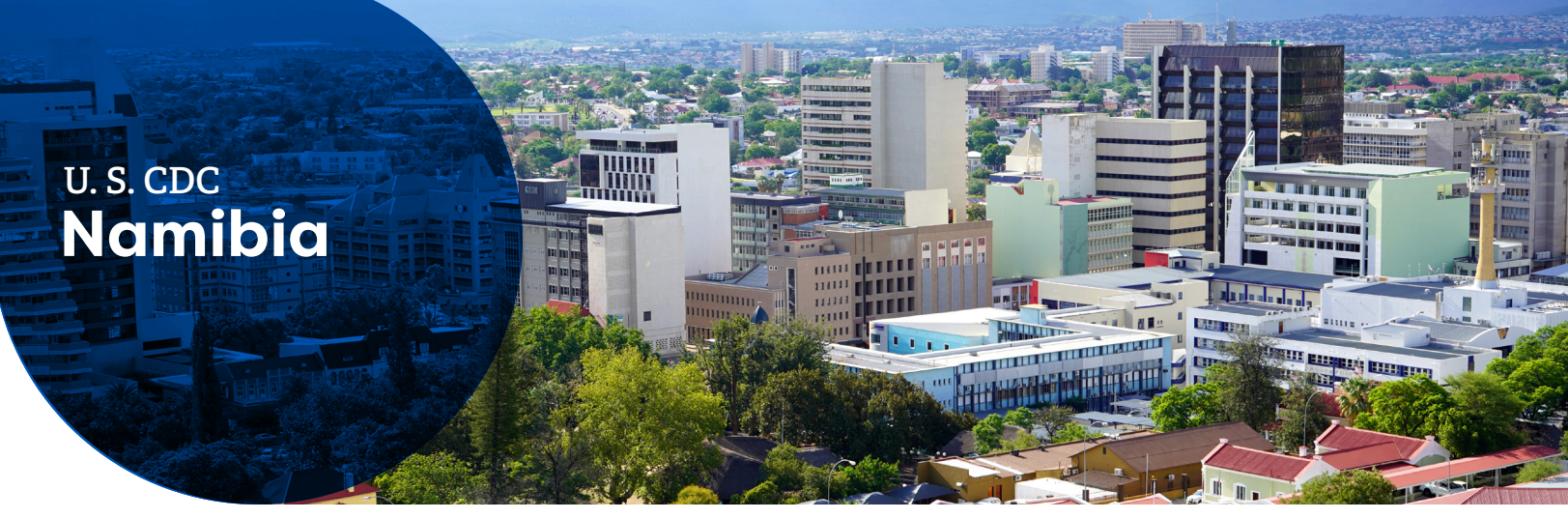
Accessible link: https://www.cdc.gov/global-health/countries/namibia.html

CDC established an office in Namibia in 2002. The office collaborates with the Ministry of Health and Social Services (MOHSS) and partners to build and strengthen the country's core public health capabilities. These include data and surveillance; laboratory capacity; workforce and institutions; prevention and response; innovation and research; and policy, communications, and diplomacy. Program areas address global health security, workforce development, clinical and laboratory systems, HIV, and tuberculosis.