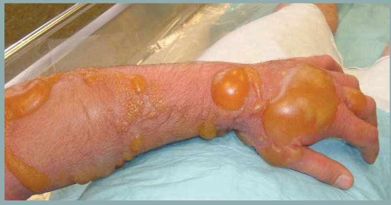
Example of Burns and Blisters from Mustard Exposure