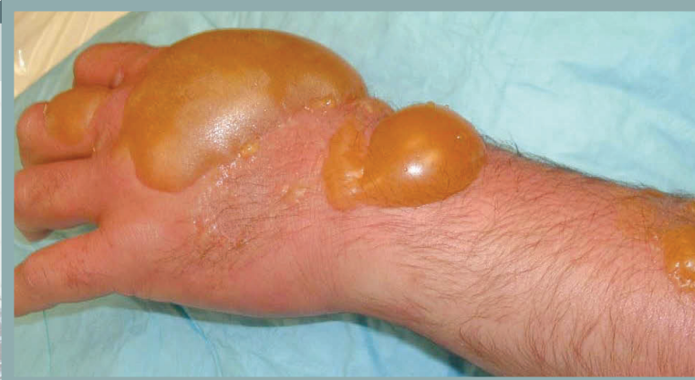
Example of Burns and Blisters from Mustard Exposure